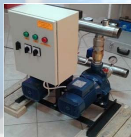
TABELA PROTIVPOŽARNIH POSTROJENJA SA DVE PUMPE U KASKADNOM SPOJU